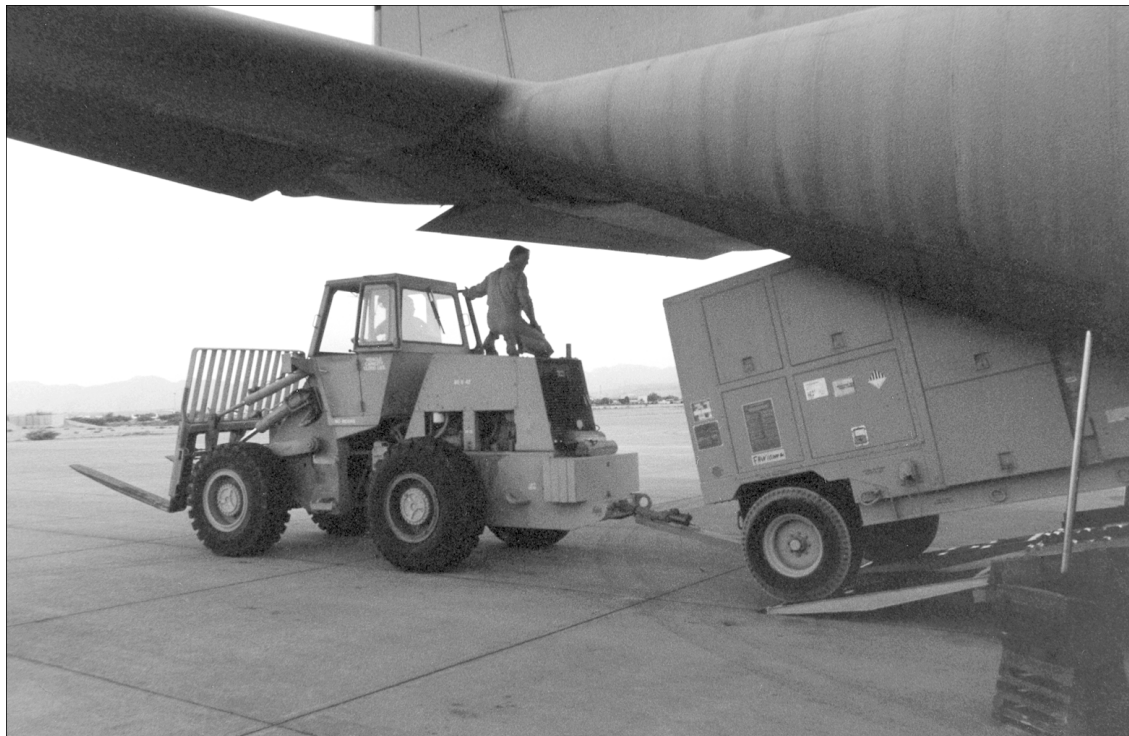
Master Sgt. Randy Engelstad, a loadmaster with the 165th Airlift Squadron, guides a generator aboard a Kentucky C-130 at Seeb International Airport.